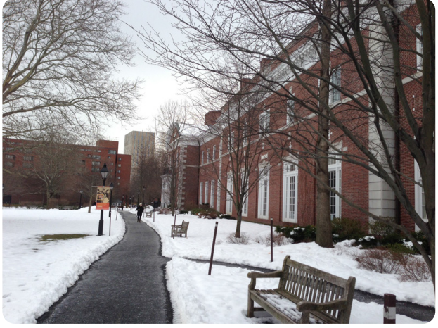
World Class University, Cambridge, MA

Prestigious University in the Boston Area Choose Fibrelite's Lockable Steam Covers to Eliminate Safety Hazards