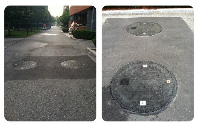
Fibrelite lockable steam covers

Since installing Fibrelite steam covers, the university has experienced significant reductions in heat transfer from the vault to the manhole surface. Further installations across the campus have now been scheduled as part of a replacement program for numerous 36", 30" & 24" steam covers.