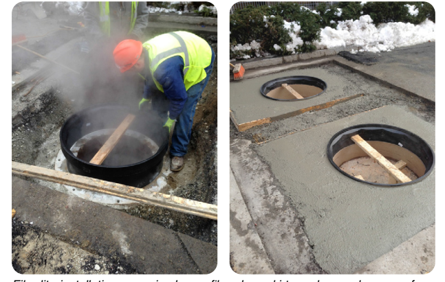
Fibrelite installations are simple – a fiberglass skirt can be used as a preform and to set the frame at grade

The thermal gradient properties of Fibrelite's composite steam covers significantly reduce the heat transfer from a steam vault to the surface of the cover. Typically, the surface temperature of the cover will be slightly above the ambient temperature at street level even when subjected to extremely hot temperatures on the underside. Fibrelite's composite access covers have been tested to temperatures up to 400°F while still maintaining their "cool to touch" properties and ability to support vehicular loads.