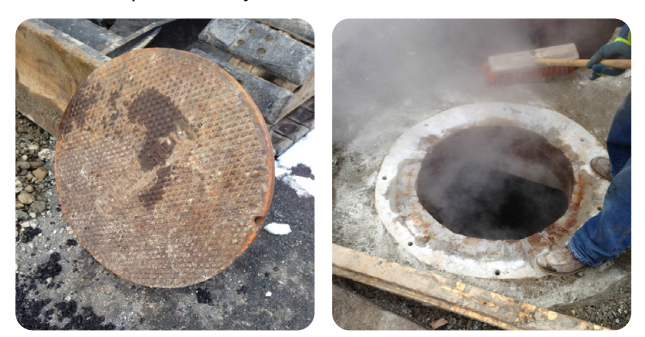
Large cast iron covers are both very heavy and extremely hot when exposed to steam within the manhole

Initially the university decided to replace the two manhole covers that were located outside the campus daycare center to eliminate the hazards presented by hot steam manhole covers.